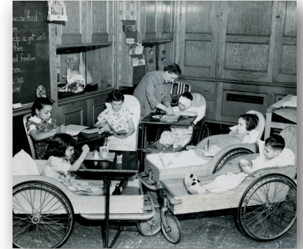
Students in open air classroom, 1957, Pittsburgh Public Schools Photographs, MSP 117, Detre Library and Archives, Heinz History Center.

The Consortium leads the effort to tell the history of the Polk Center, on whose grounds was once one of the most populous institutions in the nation and where now operates an Intermediate Care Facility for people with Intellectual Disability (ICF-ID). Through preservation, exhibits, and storytelling, the still evolving story will not be lost to future generations.